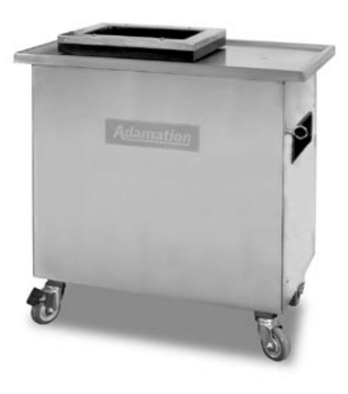
The Industry Leader in Burnishing Adamation Burnishers are in use in nearly every country of the world, and have been the standard of the industry for over 40 years.